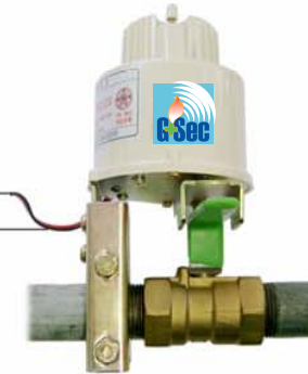
AUTOMATIC SHUT-OFF VALVE